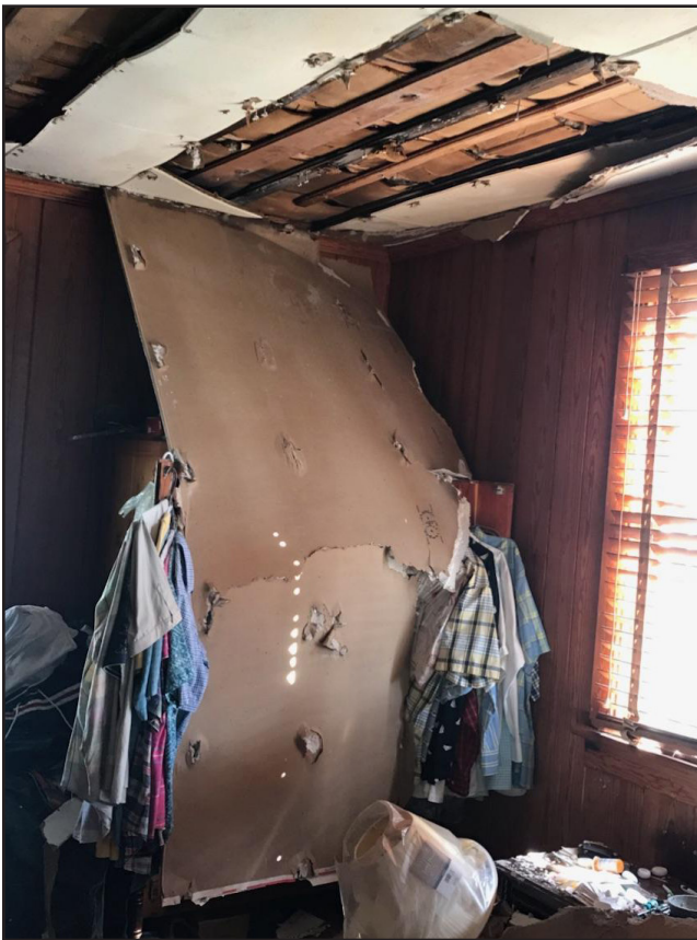
A collapsed ceiling at 15 East Henderson St.

One of the areas hit hardest by the rain was the Sea Oat Condominium complex on Sea Oats Lane, which is just south of the Holiday Inn on North Lumina Avenue,