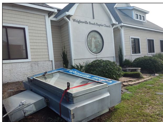
Winds knocked over the sign of the Wrightsville Beach Baptist Church.